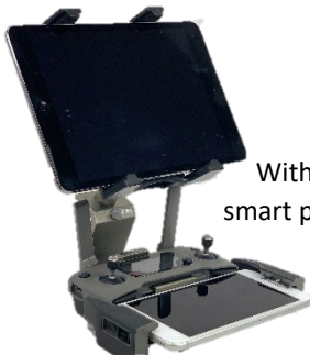
With your smart phone