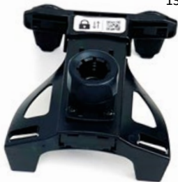
Tablet clamp Compatible with 7.9" up to 13" devices