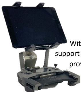
With the support plate provided