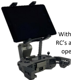
With the RC's arms opened