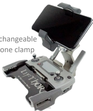
Exchangeable phone clamp