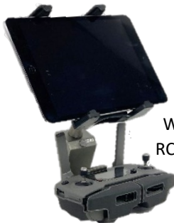
With the RC's arms closed