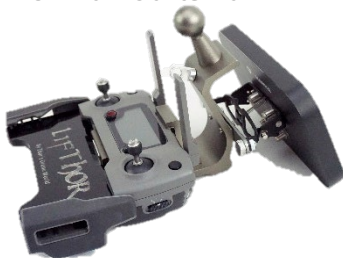
Mounting bracket for 4Hawks antenna